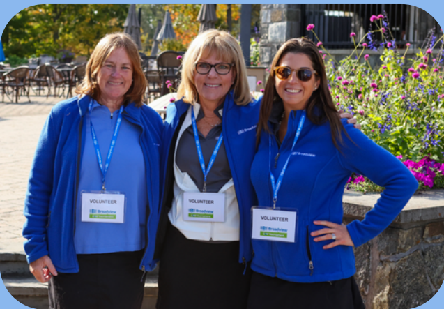
Broadview Golf Tournament at Saratoga National

This tournament is a powerful reminder of Broadview's commitment to community and the impact we create together.