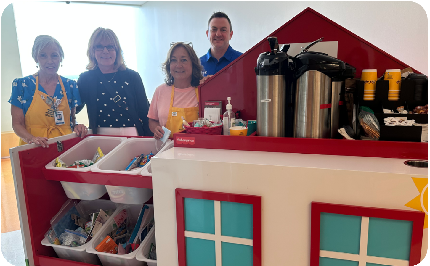
Ronald McDonald Hospitality Cart at the Ronald McDonald House in Buffalo