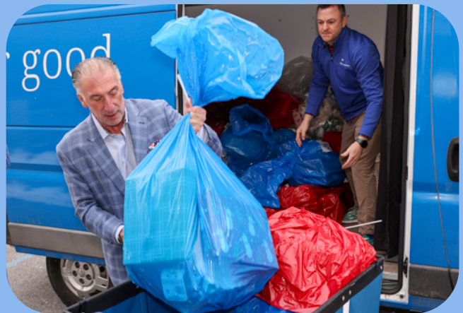
Holiday Sharing delivery day

Member contributions totaled $78,385 , including over $23,000 raised in branches and more than $54,000 through digital banking . These funds supported individuals served by 75+ nonprofits statewide , engaging thousands of employees and members in the effort.