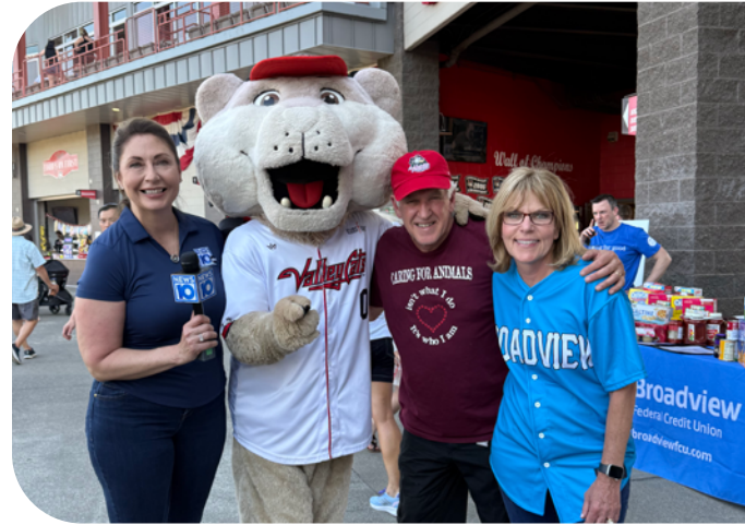
No Neighbor Hungry food drive in partnership with Tri-City Valley Cats

Broadview Federal Credit Union is proud to announce the awarding of more than $140,000 in infrastructure and safety grants to 18 nonprofits across upstate New York . Recipients will use these funds to make critical structural, and facility upgrades and security enhancements. More than 100 applications for funding were submitted during this year's funding cycle. Ultimately, 18 projects were selected based on impact and urgency. A few