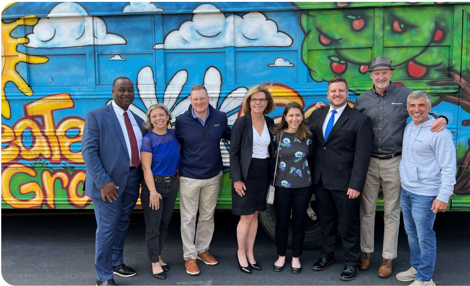
CHOW Mobile Grocery Bus

the Boys & Girls Club and Girls Inc, to partnering with organizations offering youth mentorship, high school graduation support or plans for post graduate success, Broadview's desire to invest in these crucial areas of youth development is fundamental to our philanthropy.