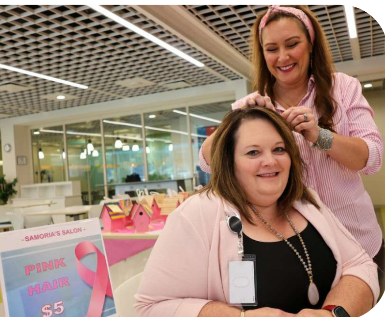
Breast Cancer Awareness Month

This year Broadview's staff forged a strong connection to support HicksStrong, an organization with a mission to save military lives by connecting veterans and active-duty service members to confidential mental health therapists via telehealth. These mental health visits are provided free of charge, thanks to HicksStrong. Broadview staff painted over 275 Hug Mugs over the course of a dozen volunteer events to be sent to veterans and active-duty service members they serve.