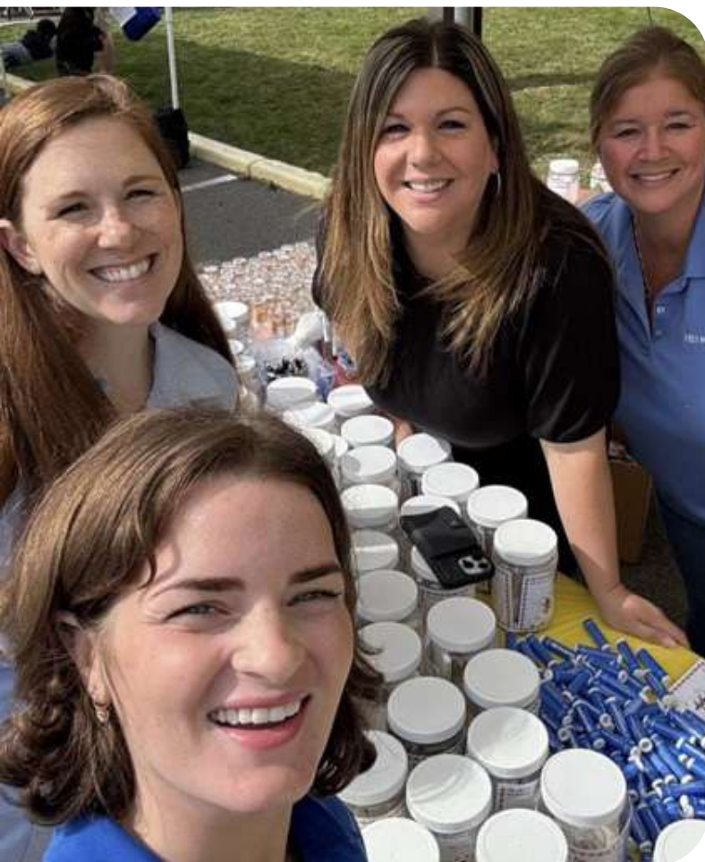
Broadview Financial Education Team