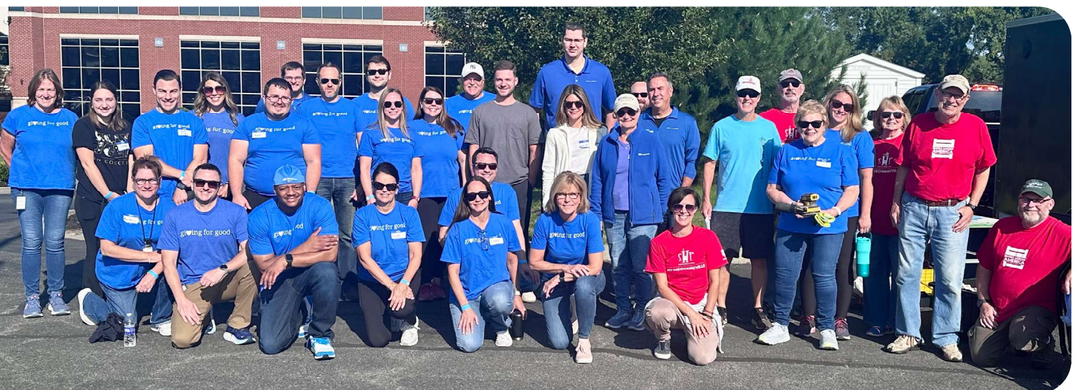
Sleep in Heavenly Peace building team

In addition to building beds, we provide financial and in-kind supply donations are to organizations serving underserved youth. From our Summer of Luvs campaign where we donated $10,000 worth of diapers to support the youngest of children, to investing in programs focused on safe afterschool and summer programs like