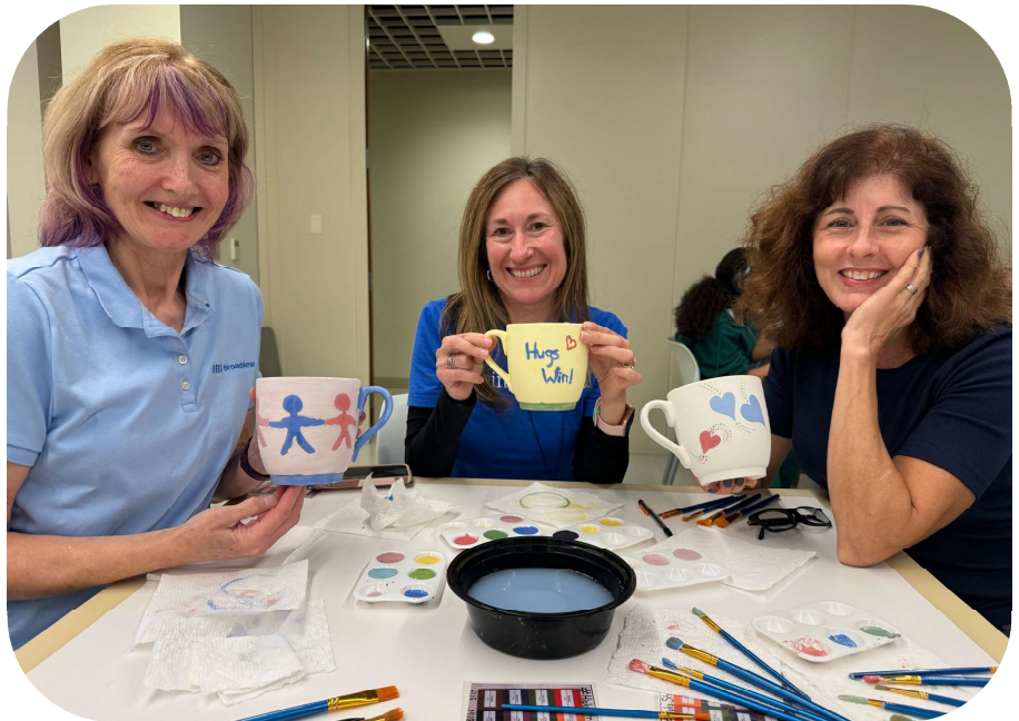
HicksStrong Hug Mug Project

Our employees not only fundraise, but they regularly volunteer to support people affected by illness and disease. It is common for staff to cook healthy meals