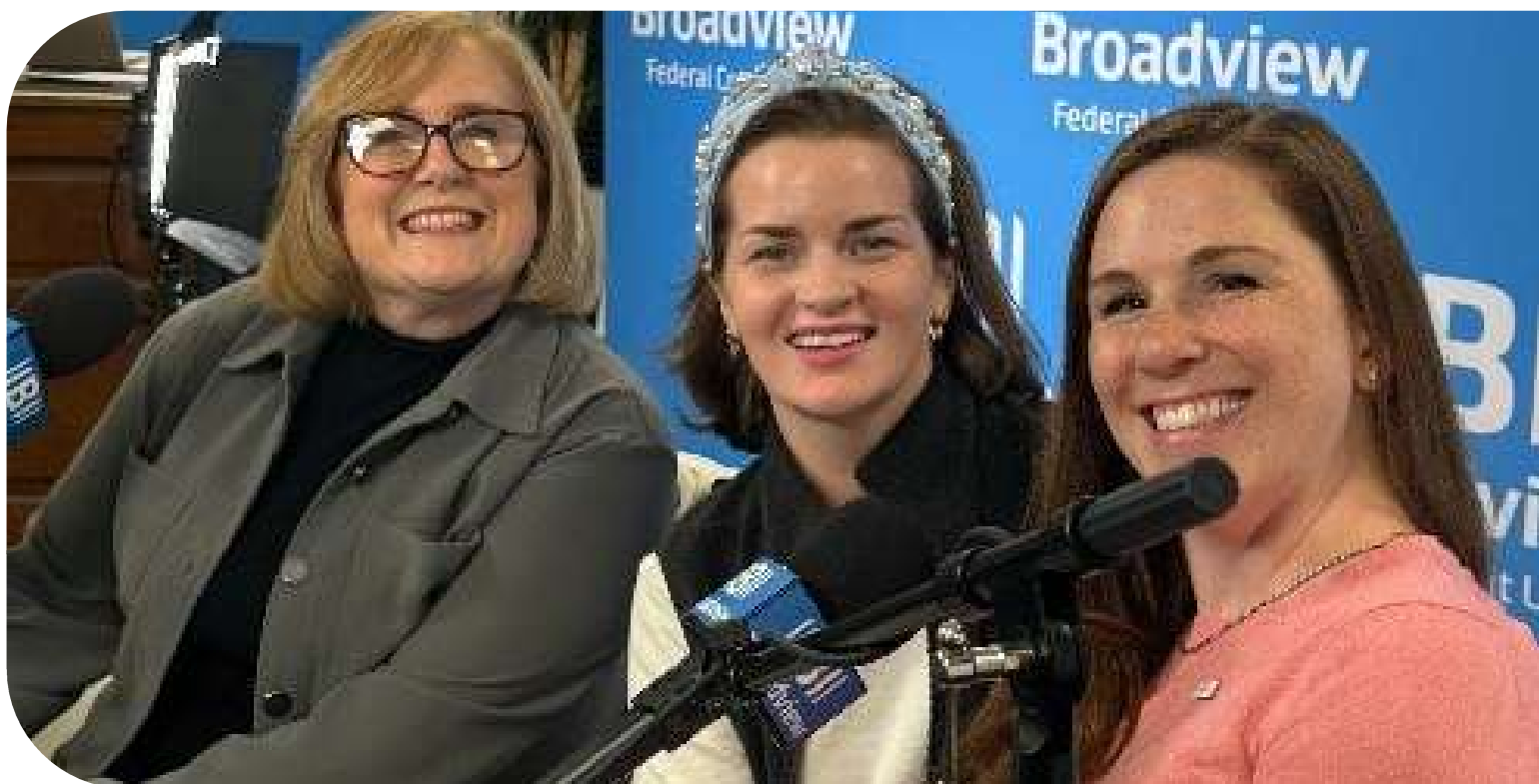
College Bound | Ask the Experts

funding include; Holy Spirit School, Maimonides School, Woodland Hill Montessori, Guilderland High School, Schalmont High School, All Saints Catholic Academy, Cohoes High School, Cairo-Durham Middle School, Eagle Point Elementary, Gardner Dickinson, Donald P. Sutherland, and Glen Worden Elementary.